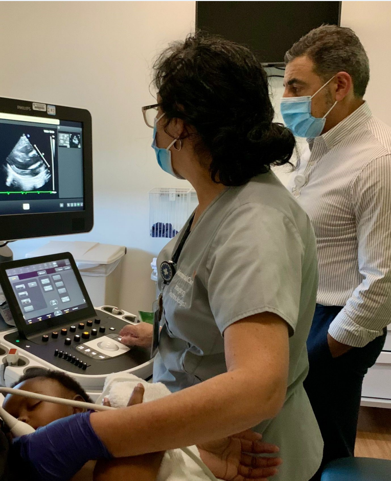
Above: Staff at Miller Children’s & Women’s Hospital provide pre-operative care for a WPP child from Barbados